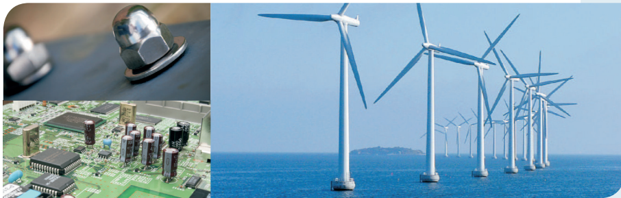
Middelgrunden wind farm, Denmark